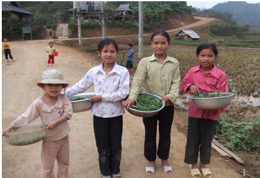
Fig. 3. Children harvested different types of edible grasses in Nam Son Commune

Meals in Nam Son Commune are one of the most attractive things for outsiders. Most food is made or grown with their own hands at Nam Son Commune, except for salt and nuoc mam (fish source) that villagers cannot produce in the village. There were many local varieties in the dishes, such as rice, millet, maize, leaf vegetables, legumes, free-range chicken and local pigs. Local chickens and pigs were fed with local vegetables, rice bran and maize, so the meat was delicious. When villagers cooked those high quality meats, they used the leaves of Mac Mat ( Clausenaindica ) and pomelo to wrap the meat and grill it. Other local specialties including rats, silkworm, wasp and the larvae of dragonflies were also served. In late spring,