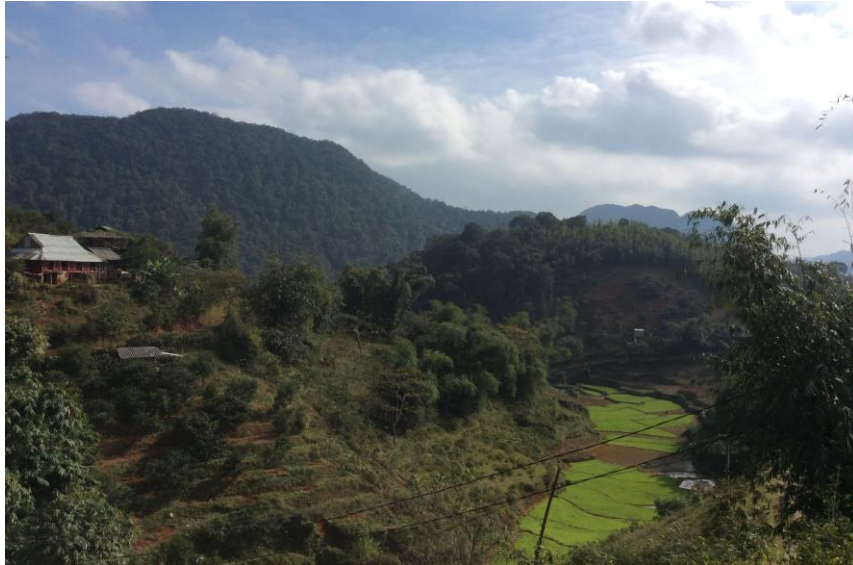
Fig. 2. Beautiful landscape of Nam Son Commune